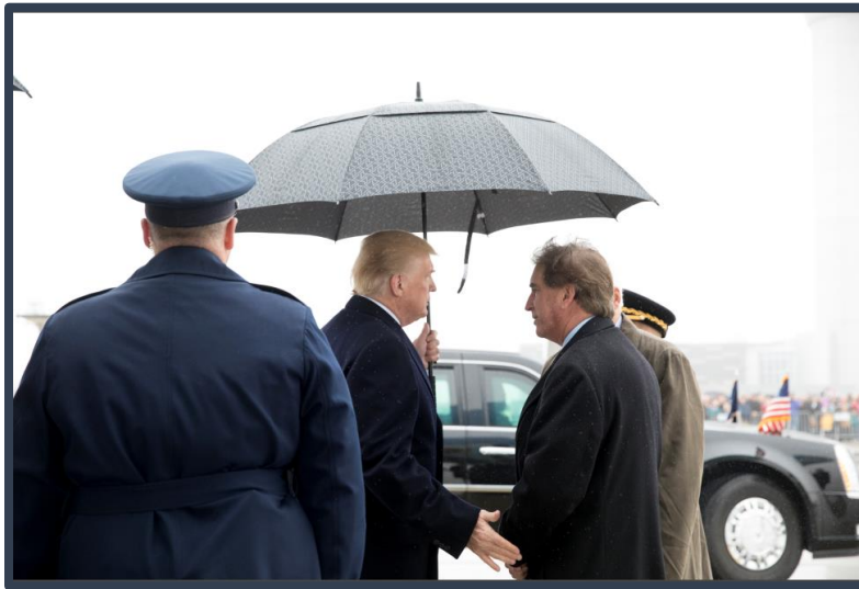
President Trump and Congressman Jim Renacci in Ohio

President Trump unveiled his Infrastructure Initiative at the International Union of Operating Engineers Local 18 Training Site in Richfield, Ohio . The President's Infrastructure Initiative has a target of $1 trillion in infrastructure investment funded through a combination of new Federal funding, incentivized non-Federal funding, and newly prioritized and expedited projects. President Trump was proud to stand with Ohio Congressman Jim Renacci and members of Local 18, a union that serves over 15,000 members from 85 of Ohio's 88 counties.