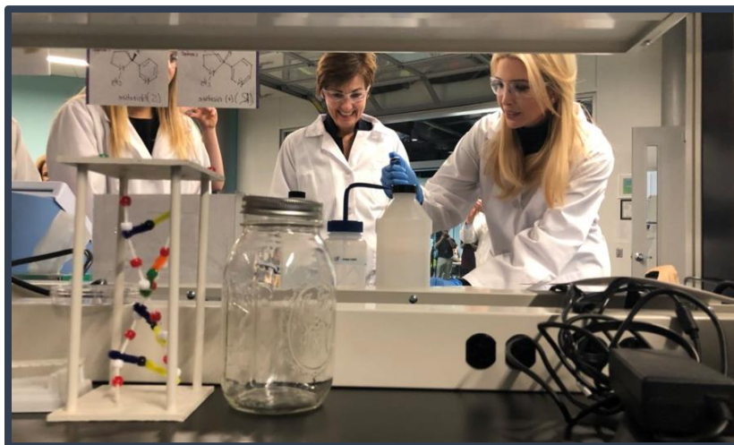
Assistant to the President Ivanka Trump and Governor Kim Reynolds

Assistant to the President Ivanka Trump joined Governor Kim Reynolds for a tour of the Waukee Innovation and Learning Center. They met with students and faculty and discussed skills-based training and tech education demonstrating the President and Governor's shared commitment to workforce and high-tech skills development.